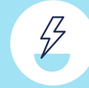
Voltage optimisation & power factor