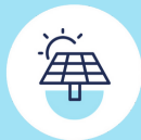
Solar power & storage

Invest in two or more of any of these types of energy-efficiency equipment to be eligible for our birthday offer.