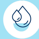
Water heating & purification