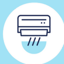
Chillers, boilers & HVAC